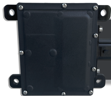
4D/PxHD Corner Radar Broad Field of View

SOFTWARE-DEFINED RADARS FOR SAFE MOBILITY