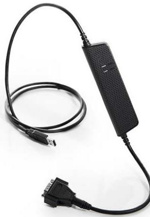
Kvaser USB/CAN Adapter