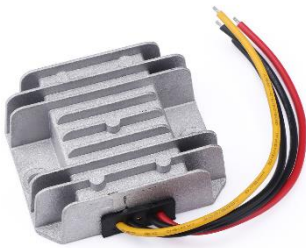
12 – 24V DROK